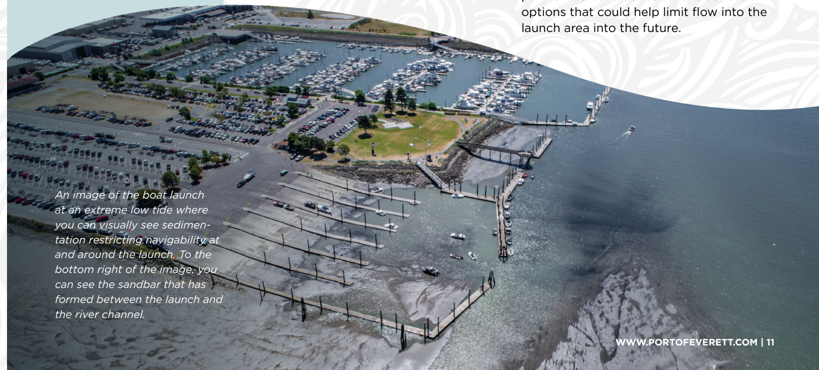
An image of the boat launch at an extreme low tide where you can visually see sedimentation restricting navigability at and around the launch. To the bottom right of the image, you can see the sandbar that has formed between the launch and the river channel.

Did you know? The boat launch was originally built in 1972 to serve the area's growing number of recreational boaters. Dubbed the Norton Avenue Boat Launch, it featured six lanes. Today there are 13 lanes, making it the largest boat launch in the state.