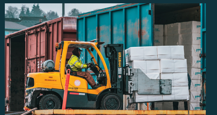
In December 2019, The Port of Everett Seaport handled its first test shipment of pulp, moving nearly 4,000 metric tons.

The Port of Everett Seaport has secured a new contract to handle 8,000 tons of wood pulp product monthly from September 2020 thru 2021. The Port’s recent investments in on-dock rail infrastructure, including the new 3,300 lineal foot rail siding completed in 2018, combined with the Port’s long-standing shipping partnerships and successful test shipments handled by the experienced local ILWU laborforce, positioned the Port to secure this work. This is the first time in 15 years the Port has handled pulp regularly at the Seaport.